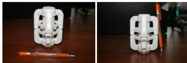
Beta version of the torque sensor (sensing part) made by Rapid Prototyping

First experimental tests on the polymer model are successful